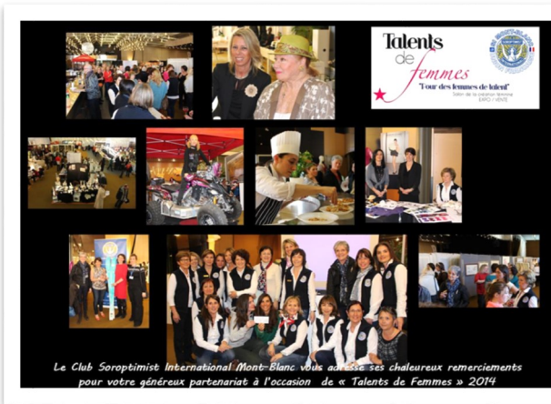
Le Club Soroptimist International Mont-Blanc vous adresse ses chaleureux remerciements pour votre généreux partenariat à l'occasion de « Talents de Femmes » 2014

With our Charter Project we took the long-term view that making our organisation known by the local community and the local authorities will give us more legitimacy and help