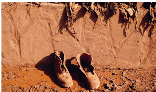
Ten people were killed and thousands lost everything in the disaster. Schoolchildren wear masks against dust from dried toxic mud in Devecser.