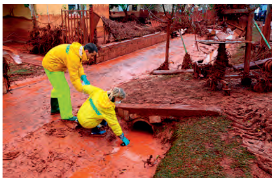
Greenpeace workers take samples to determine the toxicity of the sludge.