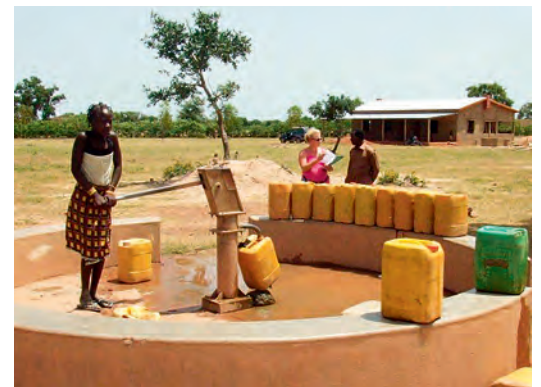
The new boreholes supply drinking water to the children of primary schools around Namassa.

Motivated by SI/E's biennium theme 'Soroptimists Go for Water', the French Clubs decided to help GUIE with boreholes. Five boreholes did not have backers, and the villagers were still drawing their water from a muddy pond! Another aim was to supply drinking water to primary schools in Babon, Guié, Cissé Yargo and the Sintenga and Wob-