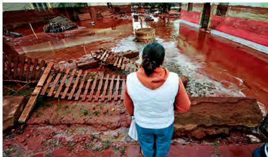
The level of the devastation was enormous after the toxic industrial sludge flooded villages.

Erzsébet Varsányi, President, Club Budapest