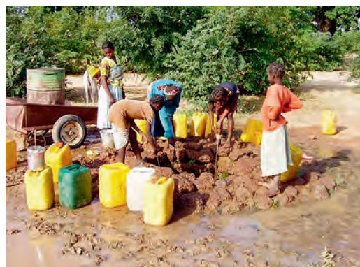
Traditional water holes cannot guarantee clean water.

This action again illustrates how worthwhile it is to collaborate between clubs and with local organisations to realise more ambitious projects.