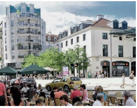
Located on the Allier River, Vichy offers delightful French charm combined with eclectic architecture.