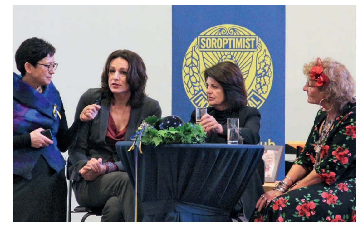
Marking Human Rights Day

Registration will close on 30<sup>th</sup> June 2015. We look forward to seeing you in September!