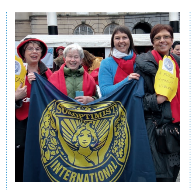
To raise awareness of violence against women, Belgian Soroptimists participated in the One Billion Rising demonstration in Brussel.