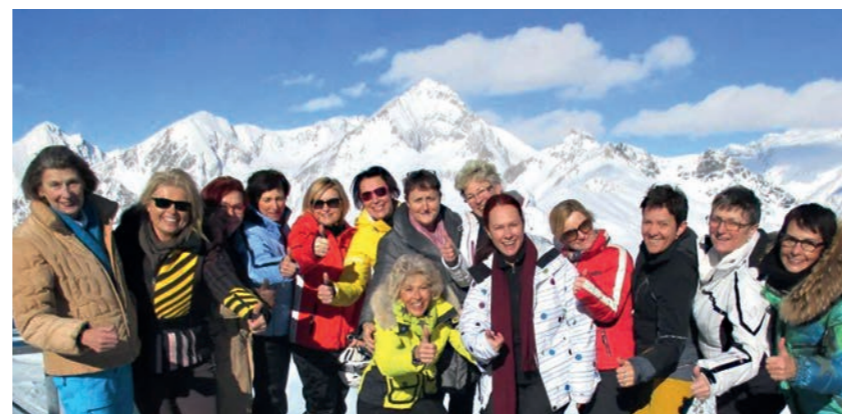
The ski week in January (left) and the golf week in April raised €3,000, which Soroptimists presented to SI Gulf Dubai on the occasion of the club charter (right).

Another successful and unique fund-raising event, organised by SI Club Goldes South Styria and SI Club Vaduz, is the Salmanazar Rallye in southeast Austria. The fourth run of this event yielded an amazing sum of €20,000, which will be invested in a reading project and other projects in the field of education.