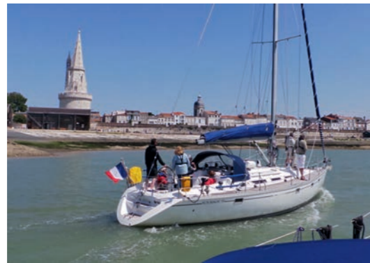
On Sunday, the Soroptimists had organised a sailing excursion for guests.