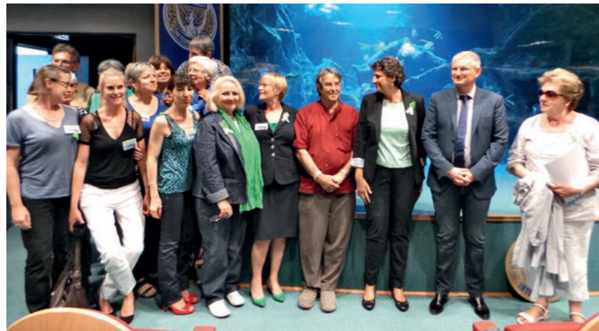
Many prominent guests and politicians attended the Ocean Conference in La Rochelle.