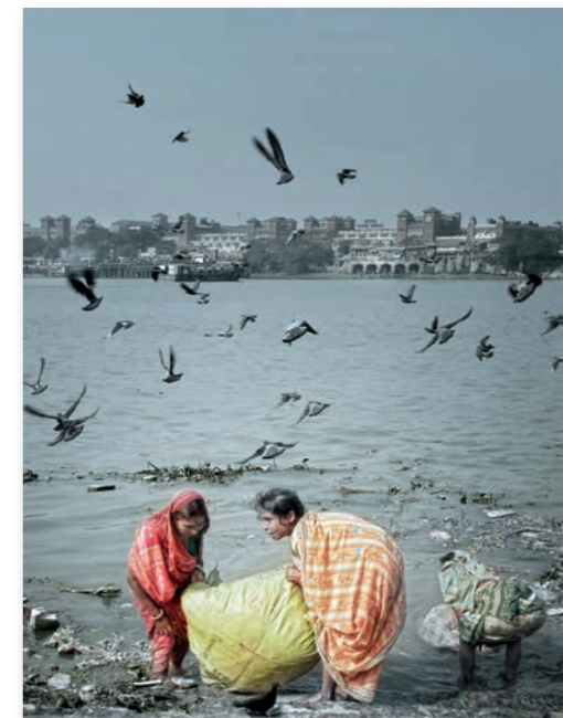
Women and Girls Securing a Sustainable Future: .....