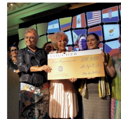
The 4th Salmanazar Rallye yielded an impressive €20,000 for reading and education projects.