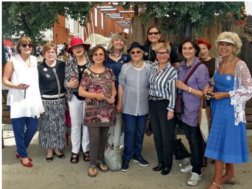
A large delegation of Soroptimist office-holders participated in the three-day programme.