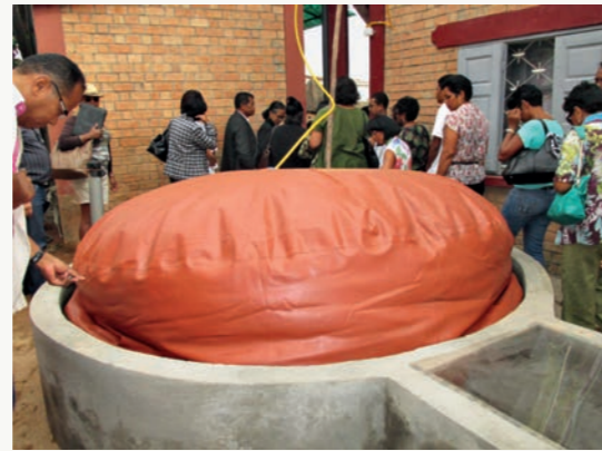
The Biogas Station installed in a school in Madagascar won the Project of the Year award.