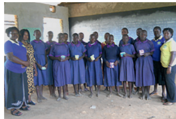
Providing girls in Mumias with sanitary napkins enables them to attend school regularly.

Girls in Mumias, Kenya are often forced to skip school during menstruation due to inadequate sanitary supplies. As they are likely to fall behind in their schoolwork, these frequent absences jeopardise their education and cause many to eventually drop out. Those who do