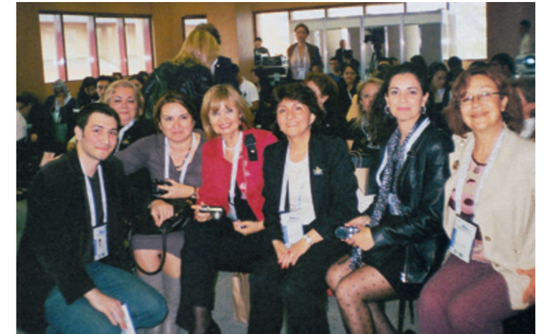
Among the participants in Water Forum in Istanbul were several Turkish Soroptimists.