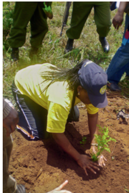
With some 5,000 Soroptimist-sponsored trees having been planted since July, the official launch of the Mau Reforestation project took place in late August.

During the post-election violence in Kenya in 2007-2008, the Kenyan Union helped families and particularly women-headed households resettle – with financial support from SIA and SI/E. SI Kenya is now taking their commitment a step further by reclaiming part of the Likia forest block of the Mau Forest Complex to remind us ‘Never Again’.