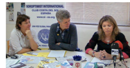
The new campaign offering a free Helpline service to women was launched at a press conference.

Since 2008, SI Costa del Sol has worked on projects related to gender violence and has been in contact with many local authorities and women's organisations that are working to fight Domestic Violence. The members of seven different nationalities decided to use their contacts and language skills and focus on the non-Spanish population,