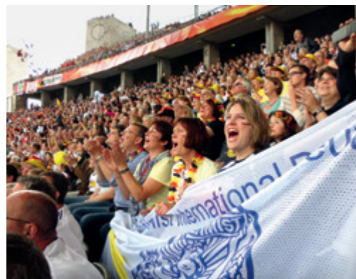
The SI block demonstrated its enthusiasm at the Olympic stadium in Berlin.

For the German Union, the main theme from 2009-2013 has been and continues to be integration, under the motto 'SOFIA', the acronym for the German 'Soroptimists for intercultural exchange'. The FIFA Women's World Cup 2011 was therefore a perfect opportunity to invite Soroptimists from