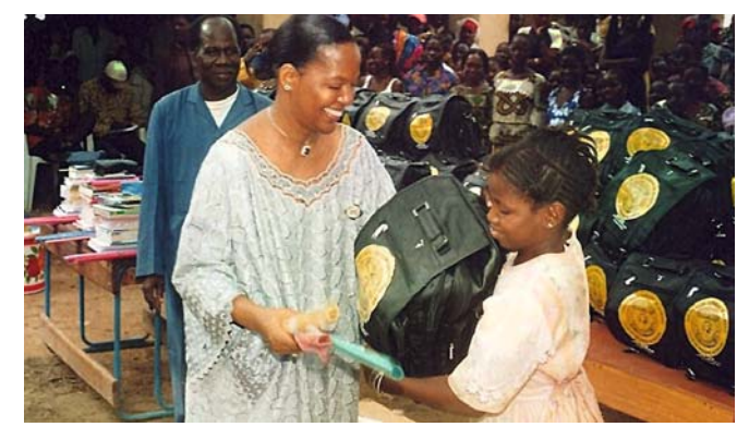
Mali has been a focus of many projects and activities to empower, educate and enable women and girls.

In the next issue we will hear from Austria, Denmark and Norway. Why not join the debate?