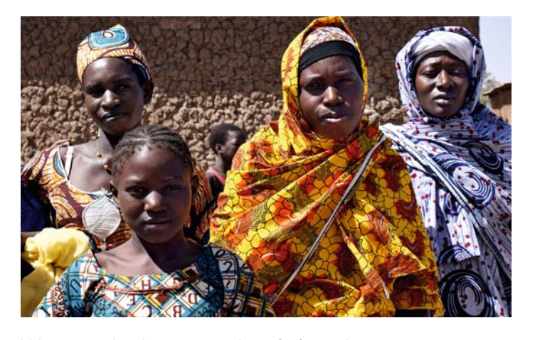
Women and girls are set to benefit from the income-generating project initiated by SI Bamako Espoir involving small-scale farming in Mali.

Keep browsing at http://soroptimistprojects. org/water-and-food!