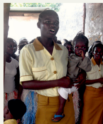
Project Sierra – A Family and A Future targeted disadvantaged women and children in Sierra Leone.