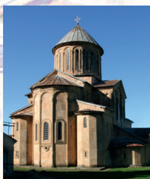
This orthodox church is just one of the memorable sights the Dutch delegation visited during its study tour.

In any case, one project for all Georgian clubs appears less practicable. The clubs prefer to have their own local project. So, for example, SI Batumi wants to help a daycare centre for men-