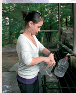
A girl from the IDP shelter in Georgia taps water from one of the tanks.