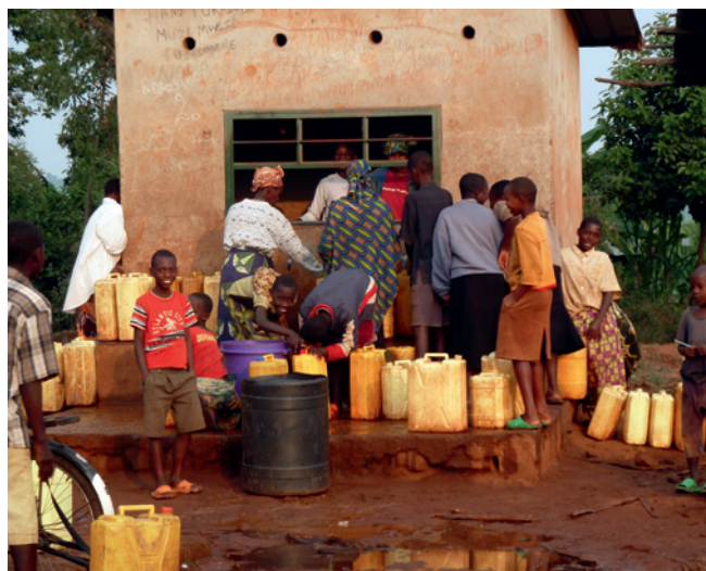
Providing better access to clean water gives women and children more time to devote to education.

Despite its modest scale, the action plan to bring water closer to homes, equip corrugated iron roofs to collect rainwater and connect tanks to a skimmer to decontaminate water contributes to vastly improving the quality of life for poor families. These crucial measures free up hours every day that women and children would otherwise spend collecting water when they could be doing something more educational or profitable.