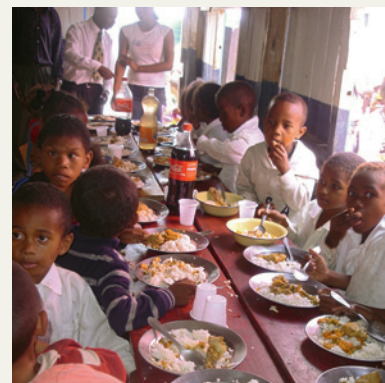
Twinned Unions of Switzerland and Madagascar cooperate to spread joy at Christmas with toys and a festive meal.