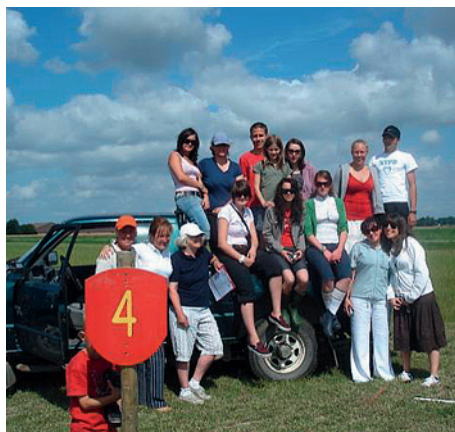
The Youth Croisière in the Netherlands in 2006.

The SI Union of the Netherlands, Surinam and Curaçao is honoured to invite 12 young people to a Youth Croisière from the 6 th -17 th July 2012. The 2012 Youth Croisière will enable young people to experience Dutch culture, enjoy Dutch hospitality, visit different parts of the Netherlands and interact with young people of different nationalities. The invitation covers accommodation as well as a diverse and exciting programme. Candidates should be between the ages of 17-20 and a relative or friend of a European Soroptimist. Applicants must speak English and be able to correspond by e-mail. Travel expenses to and from the Netherlands, pocket money, health and accident insurance as well as coverage for luggage loss are also the responsibility of applicants.