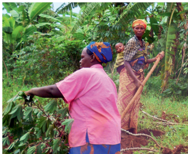
Women can grow their own food in special gardens, which also allows them to earn a small income.