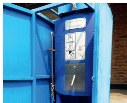
This Naiade water purifier will help supply 400 people with clean drinking water every day.

In terms of food projects, the Italian Union and its clubs have helped provide economical ovens at a cost of around € 35 a piece, including installation. They enable both culinary and sanitary improvements and use 50 percent less fuel (wood or coal). In addition, a two-day intensive cookery and food safety course was introduced at a cost of some € 40. Educational gardens are being set up in schools and for Aids sufferers who can thus grow their own food and sometimes earn money towards their medical care.