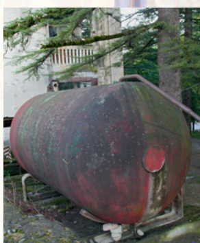
Cleaning the water tanks used to supply the IDPs living in former sanatoria is a project planned by SI Tskhaltubo.