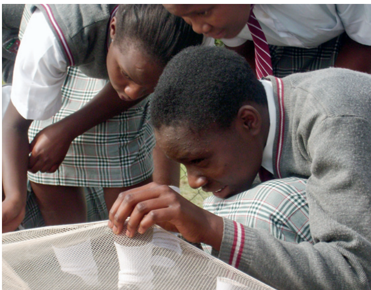
School Garden Contest of SI Milimani