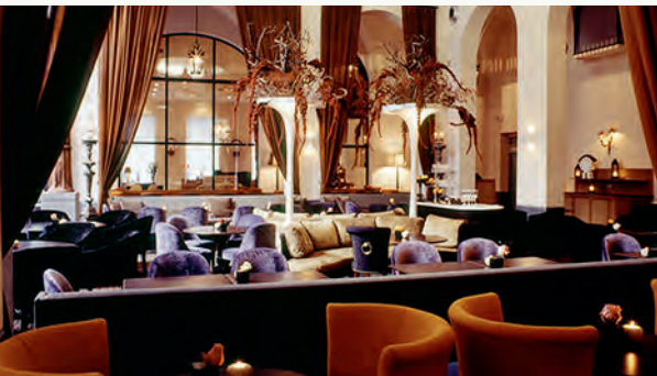
The Dominican in Brussels is the venue of the summer get-togethers.

Soroptimists from Luxembourg, Selby, Ringsted and Frankenthal enjoy a hospitality evening with Club Dnipropetrovsk.