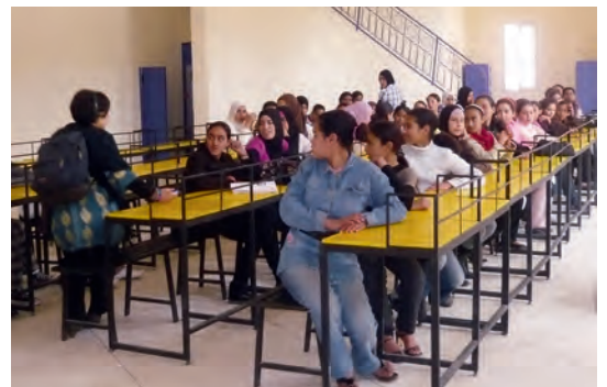
The boarding school for girls in Marrakesh.

The boarding school was originally designed for 200 girls, but at the moment there are not enough funds to accommodate this number. Each student