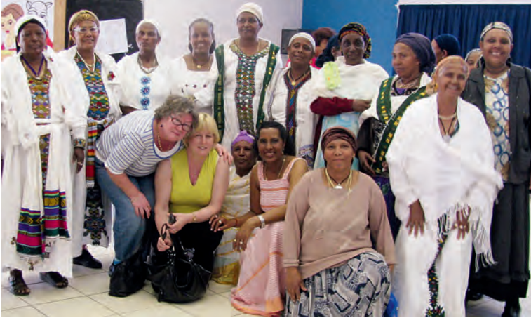
Left: The guests were impressed by the visit to Misholot Club for Ethiopian women immigrants, a project supported by Club Rehovoth. Below: Icelandic and Israeli Soroptimists pose for a group photo while on tour in Northern Israel.