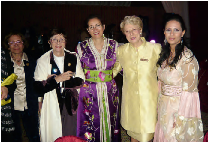
At the 10 th anniversary celebration, Club Marrakesh Fondateur was able to motivate the guests to generously donate to their project.