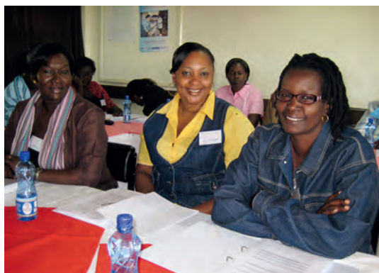
Left: The workshop participants learned how to take practical action and will take this information back to their communities. Below: Kenyan Soroptimists are planting indigenous trees to help mitigate climate change.

this part of the project the Kenyan Union will partner with the Kenya National Cleaner Production Centre (KNCPC).