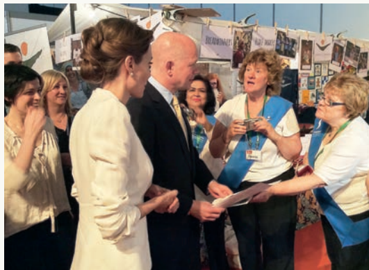
Angelina Jolie and the then UK Foreign Secretary William Hague visited the Soroptimist information stand.

SI UN Reps took part in parallel events on ending sexual violence in conflict in Geneva and New York.