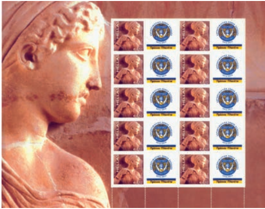
The postage stamp depicting the Greek goddess Artemis underscores the commitment of SI Greece to work for a healthy environment