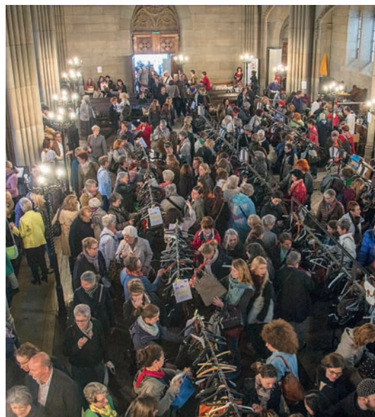
Row upon row of bags, some 3,000 in total, attracted hoards of shoppers.