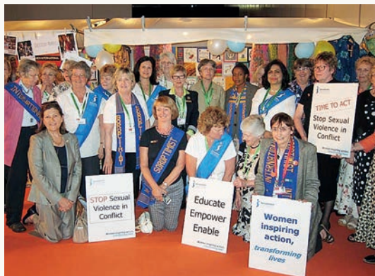
The Soroptimist delegation and speakers gathered for a group photo at the Global Summit in London.