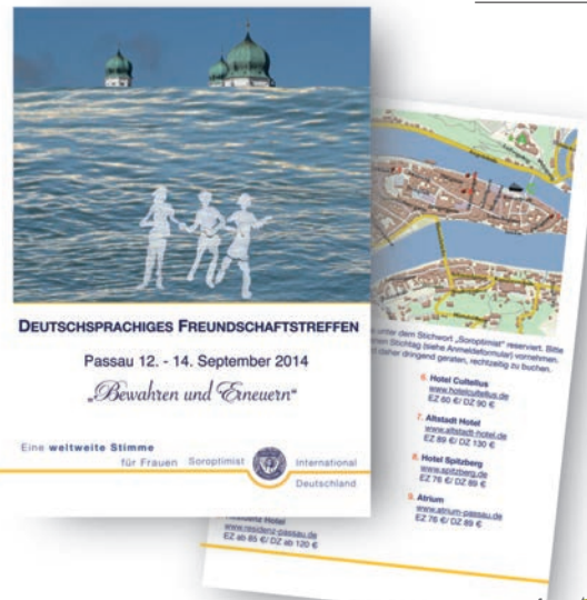
German-Language Friendship Meeting 2014

In addition to thought-provoking and interesting speeches and discussions, participants can expect an attractive accompanying programme highlighting the local culture and nature of the region. The weekend will also provide plenty of time to visit with old friends and make new ones. So, German-speaking Soroptimists are heartily