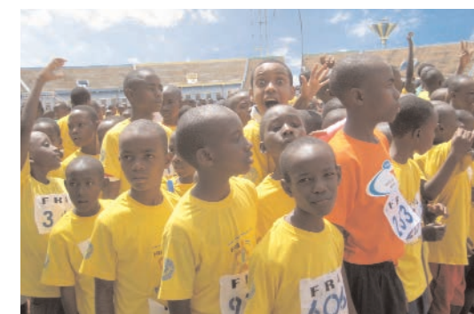
More than 400 children participated in the Fun Run in Kigali