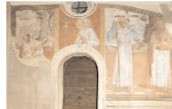
The wall paintings in the chapel of San Giuliano were restored with Soroptimist funds.

project proposed by SI L'Aquila to restore the Conventino of San Giuliano, the ancient chapel erected near the town by Franciscan friars in the 15 th century. It has valuable wall paintings and is still a place of prayer and meditation, cherished by the population of L'Aquila.