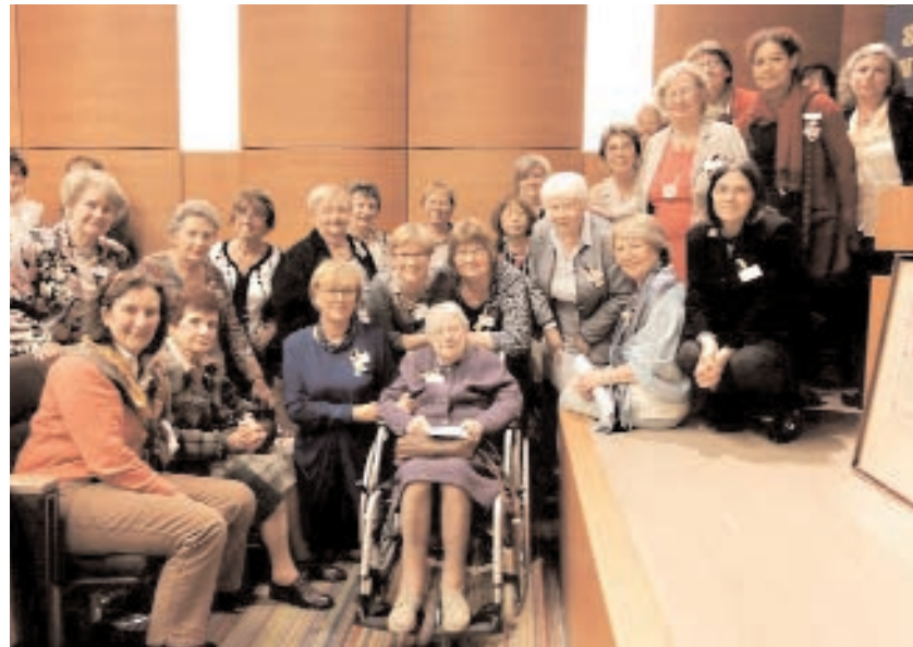
Above: Club members raised € 28,000 in support of Coupole bruxelloise de l'Autisme.