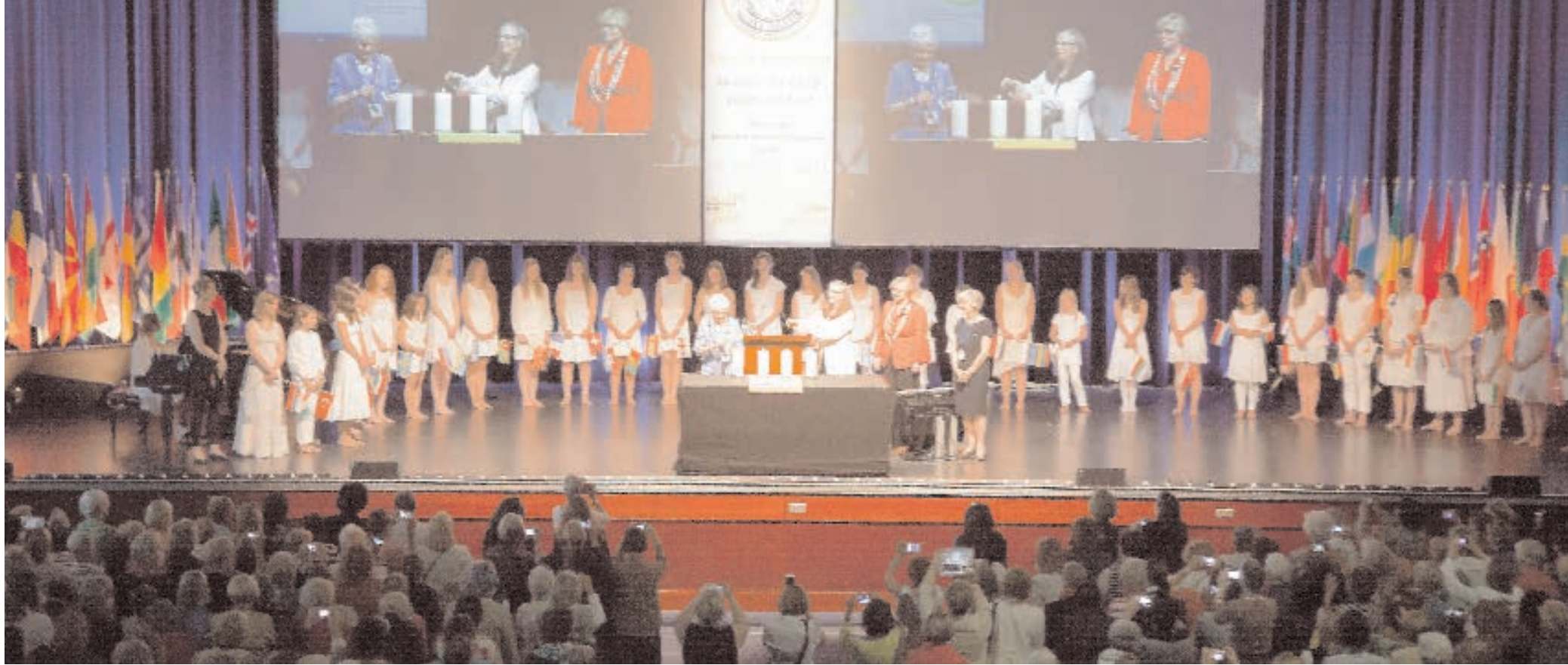
After a performance by the Girls' Choir of Berlin and flag presentation, the audience stood for the candle ceremony.