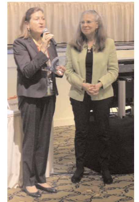
Germany for its outstanding Extension, which earned the Union this year's top award.