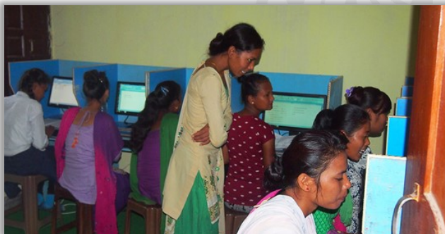
Women of the Tharu village learning computer skills

13 projects are under implementation and two are in the feasibility stage. They concern over 6,500 women and girls in Nepalese rural and mountainous regions. Covering a variety of areas, they aim to work towards, or 100% acquire female autonomy through education: distribution of computers, courses for teachers on gender equality, training of seamstresses and booksellers,