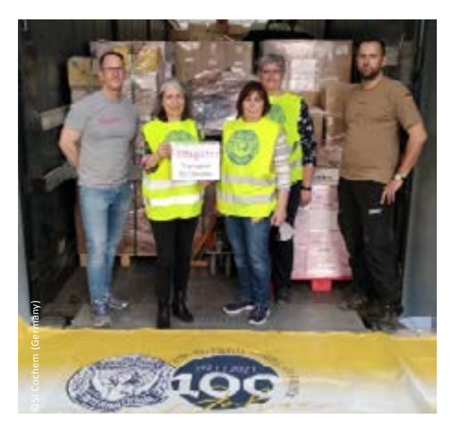
Loading a 40 ton truck with supplies to bring to SI Uzhgorod (Ukraine)

Our strength is in our numbers and how we complement one another in terms of financing, experience, network and location. Maximising this means drawing together our individual club strengths and needs. In the case of the Ukraine war, German clubs worked together in support of projects for refugees living in Germany, as well as in the war zone and neighbouring countries.