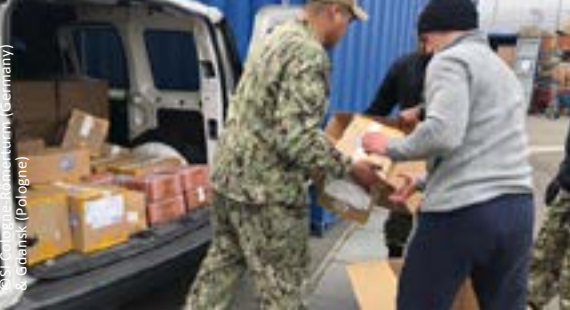
Part of the project "Ukraine Aid via our International SI Network"