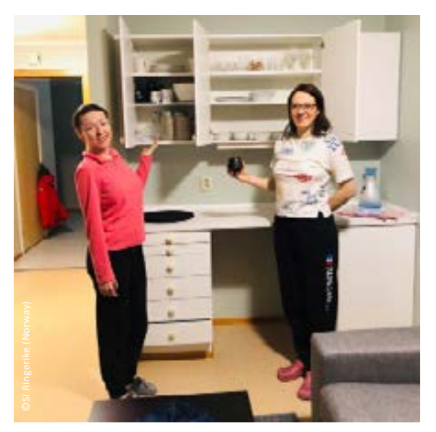
Welcoming Ukrainian refugees in Ringerike

SI Club Ringerike wanted to ensure anyone arriving would know they were welcome. The day before the refugees arrive, Soroptimists make the apartment as welcoming as possible.