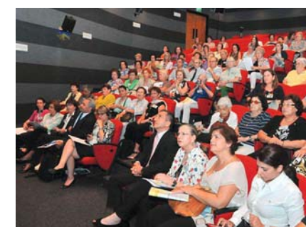
Soroptimists from near and far participated in the informative discussion of the challenges of ageing in Cyprus.