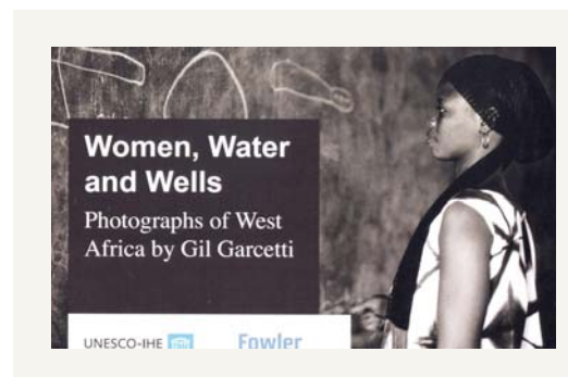
The photo exhibition highlighting the daily task fetching safe water in West Africa was widely publicised.