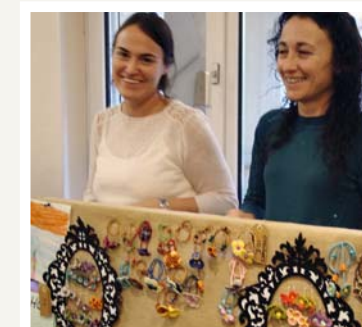
The Solidarity Bazaar in Madrid raised over €1500 for the local food distribution centre.

More information on this and other projects can be found on the Facebook profile of Soroptimist International - Clubs de España or at www.si-es.org .