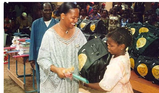
Mali has been a focus of many projects and activities to empower, educate and enable women and girls.

In the next issue we will hear from Austria, Denmark and Norway. Why not join the debate?