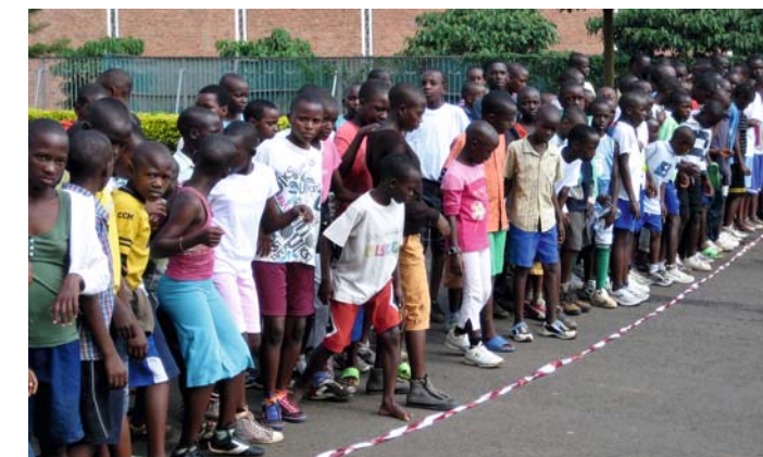
Children prepare to start their Run for Fun in Kigali!

Women and girls are set to benefit from the income-generating project initiated by SI Bamako Espoir involving small-scale farming in Mali.