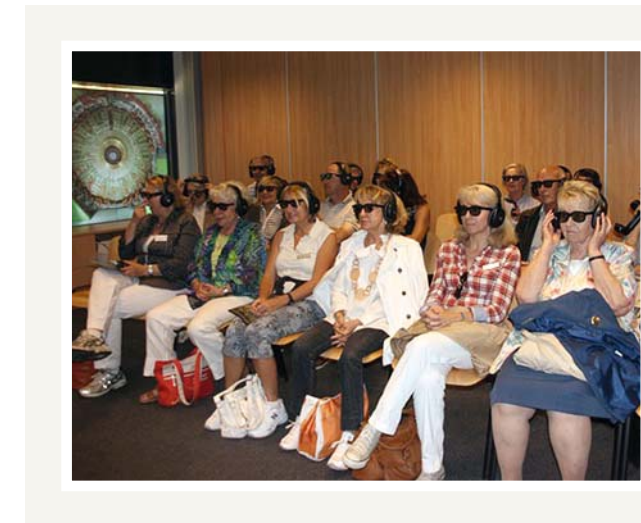
The Sillon Alpin Soroptimists enjoyed a film explaining CERN, whose particle accelerator is helping to explain the basic structure of our universe.

After a very interesting and instructive morning, the group took the bus along the pretty road through Geneva's vineyards to the village of Satigny, where the 84 participants enjoyed a very