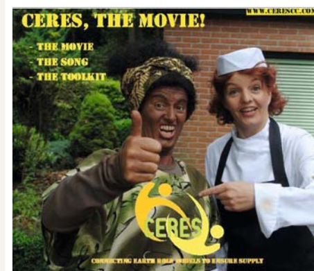
A humorous film produced by CERES shows how women can impact global food supply.

Access to food is a human right, which is now threatened by world population growth. The agricultural chain is controlled by only about 10 multinationals. In the industrialised world